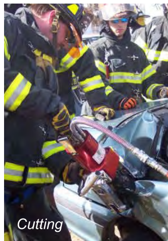
Champion SC11 in action